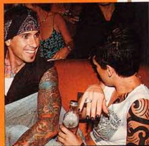
Pink and beau Carey Hart

No. The singer joked that her henna designs "didn't hurt at all" but did take a long time to apply. ▶